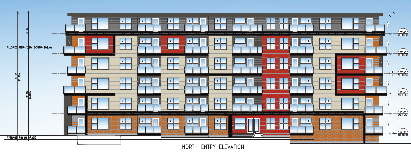
NORTH ENTRY ELEVATION