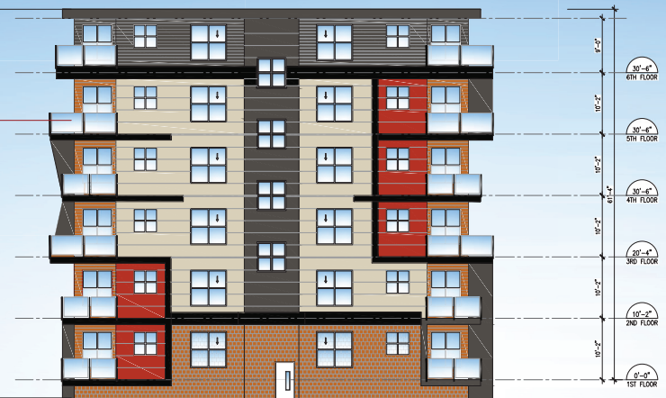
EAST ELEVATION (SIDE)