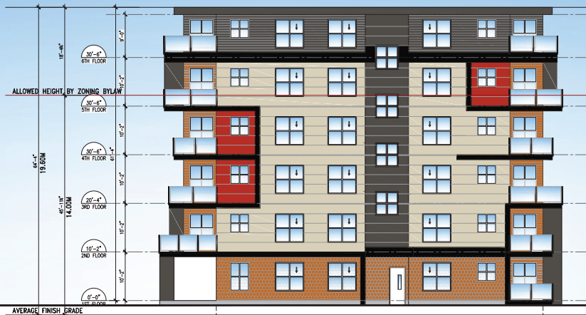
NORTH ELEVATION (SIDE)